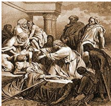
JESUS HEALS- GCN

OUR VISION IS TO STRENGTHEN AND GROW A COMMUNITY OF FAITH IN CHRIST