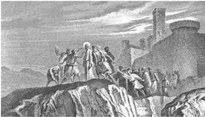
Alexandre Bida - Jesus rejected at Nazareth

OUR VISION IS TO STRENGTHEN AND GROW A COMMUNITY OF FAITH IN CHRIST