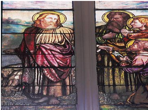
JESUS- ST. JOSEPH'S JERSEY CITY

OUR VISION IS TO STRENGTHEN AND GROW A COMMUNITY OF FAITH IN CHRIST