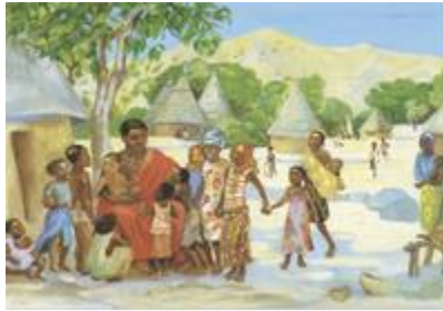
JESUS WELCOMES THE CHILDREN-

OUR VISION IS TO STRENGTHEN AND GROW A COMMUNITY OF FAITH IN CHRIST