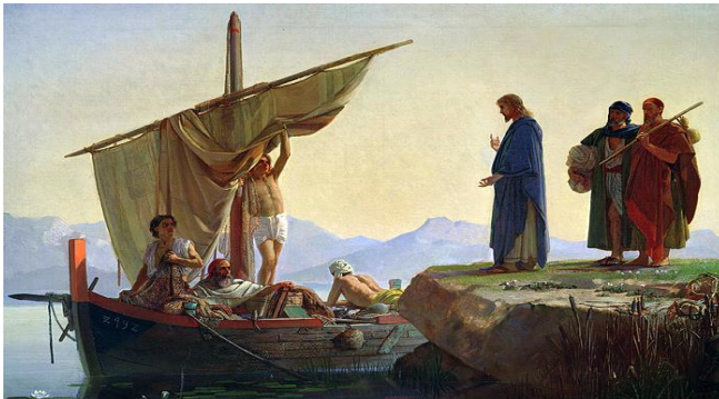
Christ Calling the Apostles James and John by Edward Armitage

OUR VISION IS TO STRENGTHEN AND GROW A COMMUNITY OF FAITH IN CHRIST