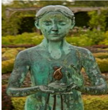
LAMP OF WISDOM

OUR VISION IS TO STRENGTHEN AND GROW A COMMUNITY OF FAITH IN CHRIST