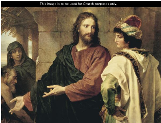
JESUS & THE RICH YOUNG RULER.

OUR VISION IS TO STRENGTHEN AND GROW A COMMUNITY OF FAITH IN CHRIST