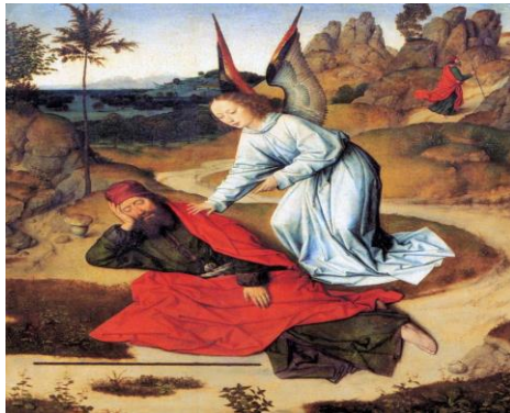
1464-68 OIL ON PANEL, SINT-PIETERSKERK, LEUVEN

OUR VISION IS TO STRENGTHEN AND GROW A COMMUNITY OF FAITH IN CHRIST