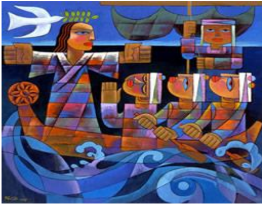
HE, QI. PEACE BE STILL.

OUR VISION IS TO STRENGTHEN AND GROW A COMMUNITY OF FAITH IN CHRIST